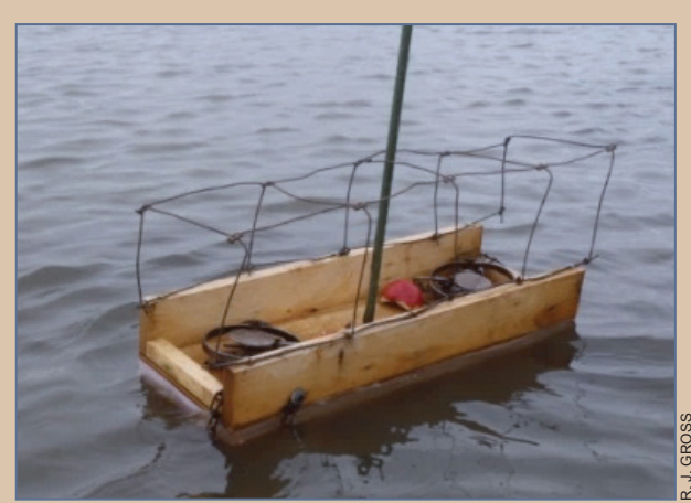
A wire covering over the platform can provide a perch for wading birds like herons, but keeps them well away from the traps.