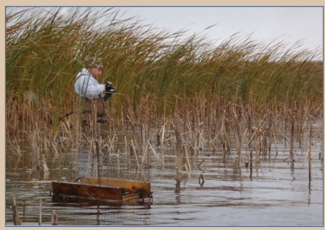
For 3 years, researchers analyzed muskrat float sets, their likelihood of capturing nontarget birds, and options for minimizing nontarget captures without sacrificing effectiveness for catching muskrats.

Additionally, floats that sit higher out of the water and are tippy or unstable in the water also deter water birds from using the float as a resting site. Floats should also look unnatural. Trappers should avoid using log floats or cover floats with cattails or other wetland vegetation.