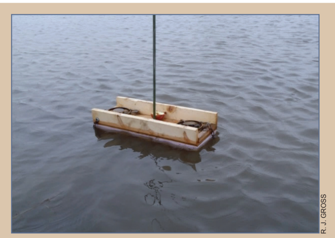
A typical float set – a wooden platform resting on a foam bottom, with traps positioned at both ends to capture muskrats as they climb onto the platform to rest.